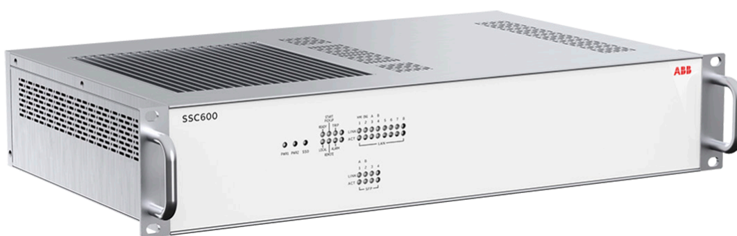
Figure 1. SSC600

ABB Ability™ Smart Substation Control and Protection for electrical systems SSC600 is a smart substation device designed for protection, control, measurement and supervision of utility substations and industrial switchgear and equipment. The design of the device has been guided by the IEC 61850 standard for communication and interoperability of substation automation devices. It is fully integrable with Relion series IEDs for creating a complete solution. Optional functionality is available at the time of order for both software and hardware, for example, special application packages and additional communication modules.